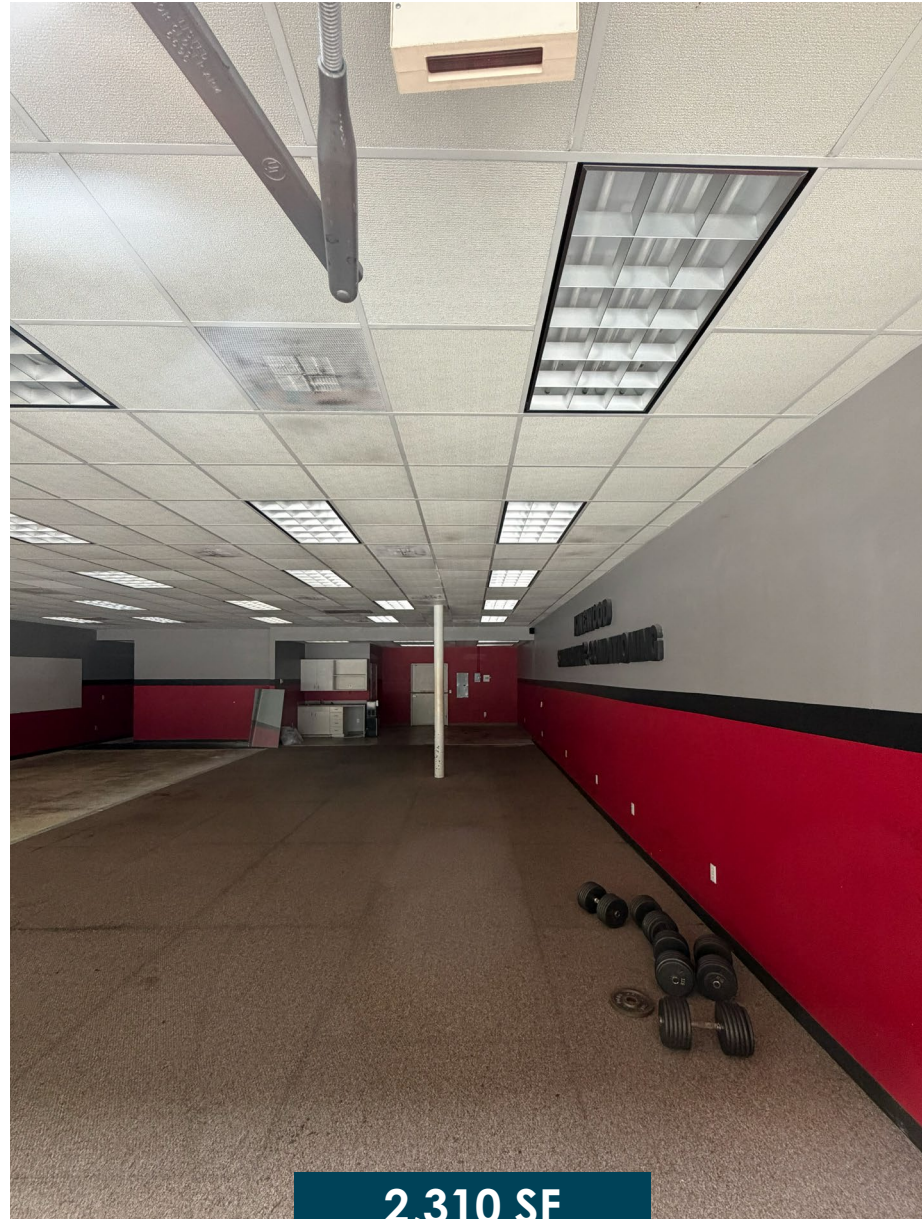
2,310 SF (2nd Gen Gym Space)