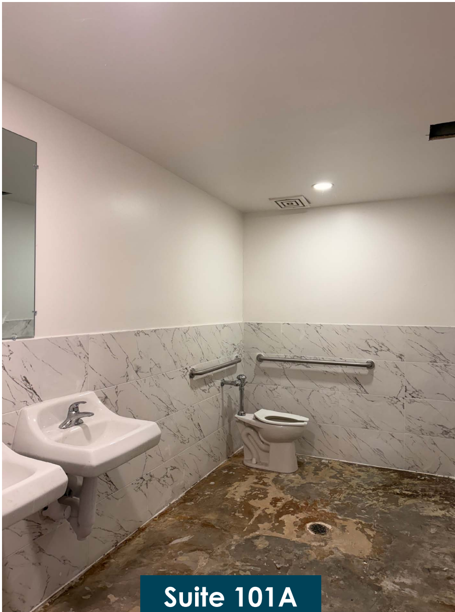
Suite 101A 2,035 SF