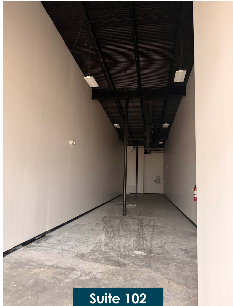
Suite 102 1,260 SF